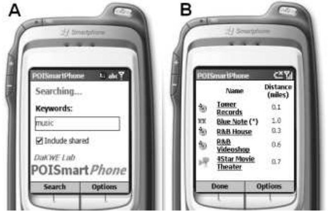
Figure 4. Screenshots of the POISmart service

Obviously, this definition is not general, but can only fulfill the requirements of a well-defined group of users. The internal work meeting of a specific organization (in this example, Unimi ) is defined as an activity performed in a place